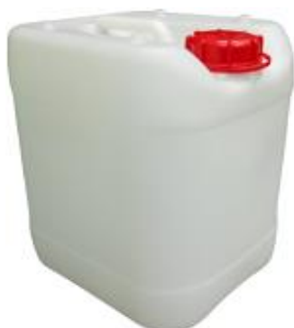
12L (A) NATURAL WHITE