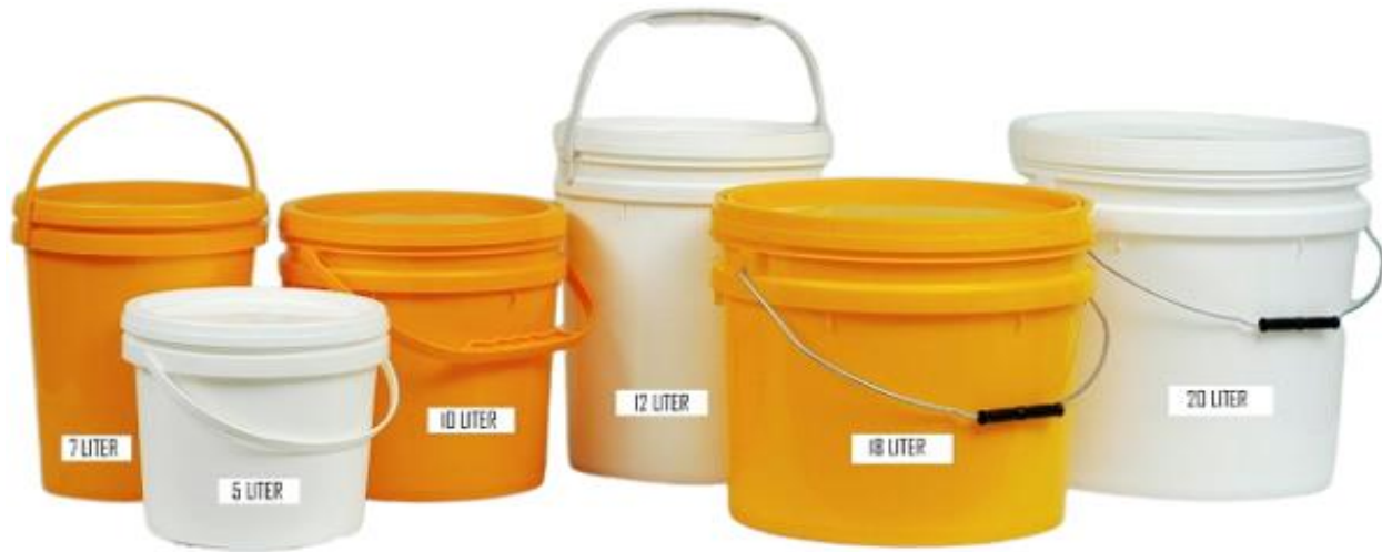
5L, 7L, 10L, 12L, 18L AND 20L PAILS YELLOW / WHITE