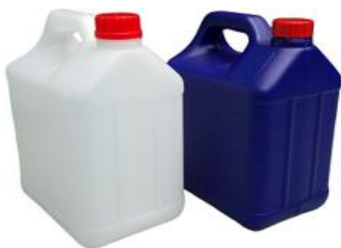
4L (A) NATURAL WHITE / BLUE