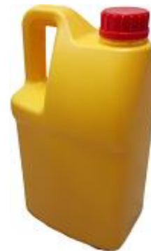
3L (P) CZ YELLOW