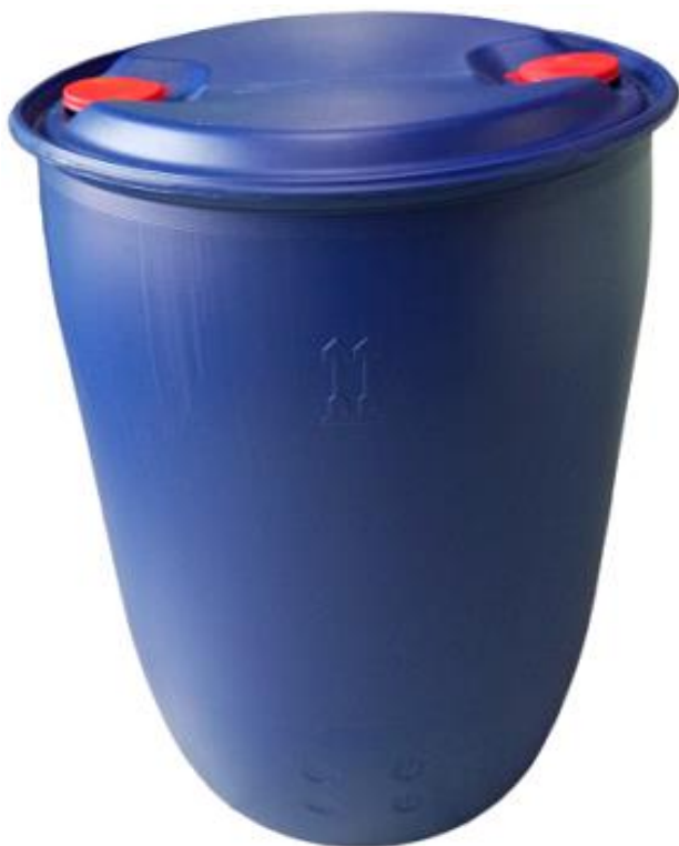
220L SINGLE RING DRUM UN 1.2 / UN 1.6