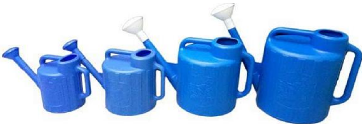
3L, 5L, 9L, 12L, 15L WATERING CAN - BLUE