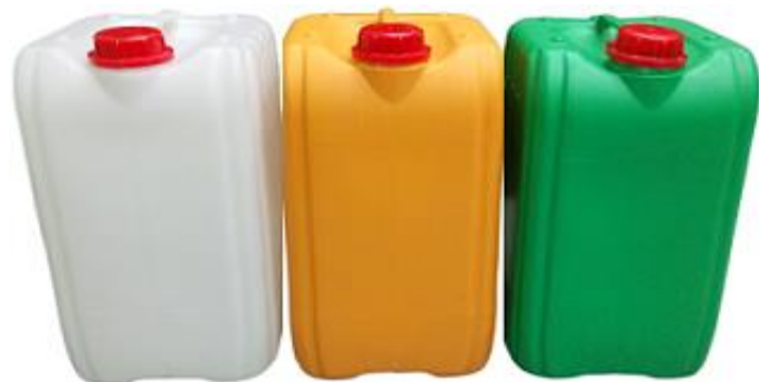
20L (G3) NATURAL WHITE / ORANGE / GREEN