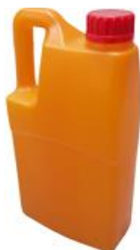
2L (P) ORANGE