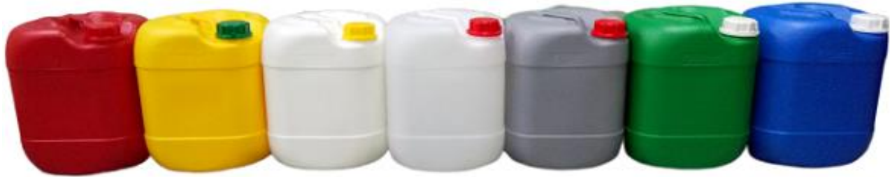
20L (CJ) UN 1.5 / UN1.8 RED / B.YELLOW / OPAQUE WHITE / NATURAL WHITE / GREY / GREEN / GB BLUE