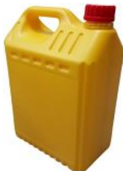
5L (M) CZ YELLOW