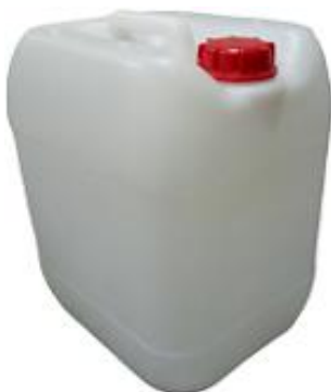
25L (I) UN 1.2 NATURAL WHITE