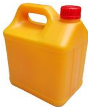
4L (A) YELLOW