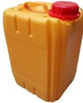
8L (AB) ORANGE