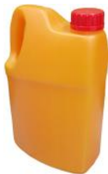
2.5L (S) YELLOW