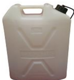
20L POL (1 MOUTH) NATURAL WHITE