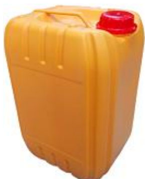
20L (G5) ORANGE