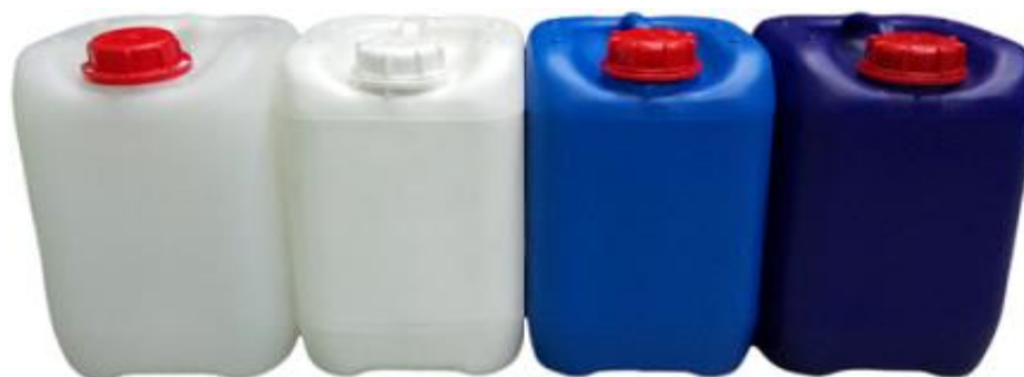
10L (H) UN NATURAL WHITE / OPAQUE WHITE / GB BLUE / BLUE