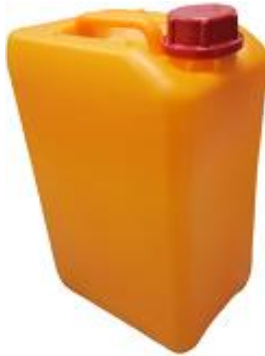
7L (S) YELLOW