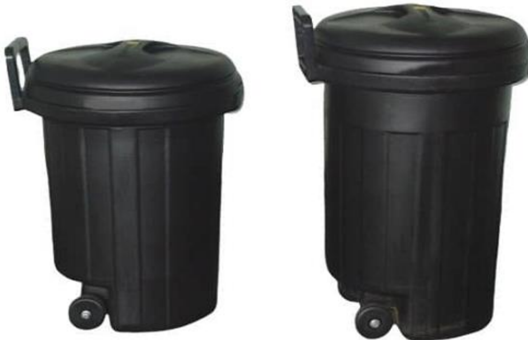
90L, 120L DUSTBIN (WHEEL) - BLACK