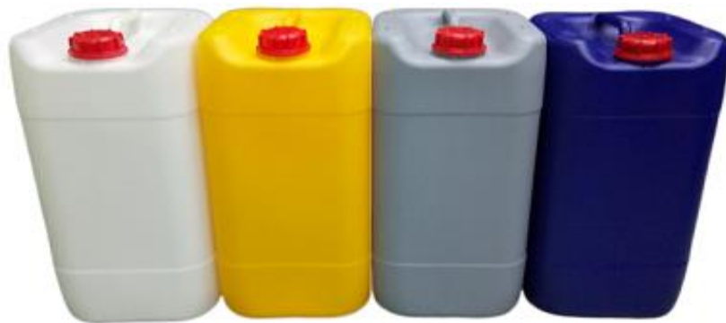
30L (AW) UN 1.2 NATURAL WHITE / YELLOW / GREY / BLUE