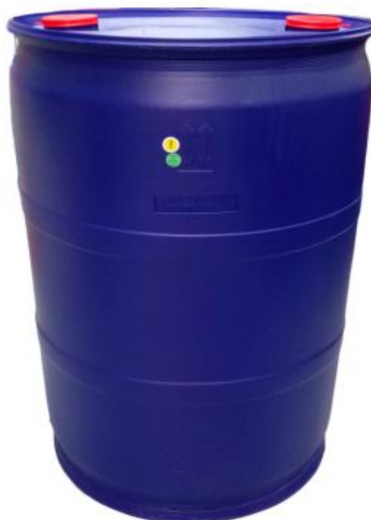
220L DOUBLE RING DRUM BLUE UN 1.2 / UN 1.6