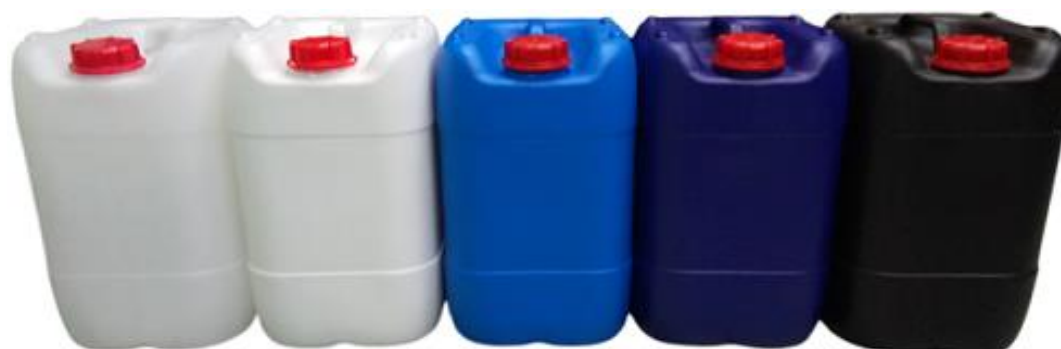
20L (N) U 1.2 NATURAL WHITE / OPAQUE WHITE / GB BLUE / BLUE / BLACK