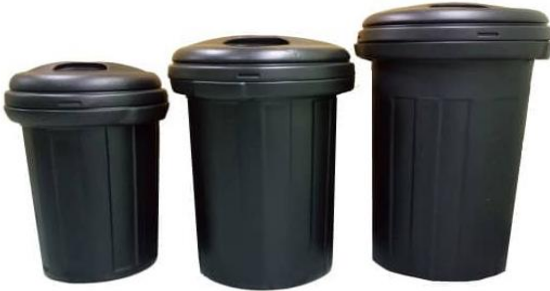
70L, 90L, 120L DUSTBIN - BLACK