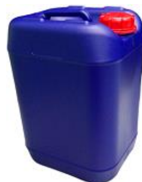
18L (C) BLUE