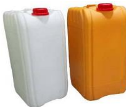
25L (G3) NATURAL WHITE / ORANGE