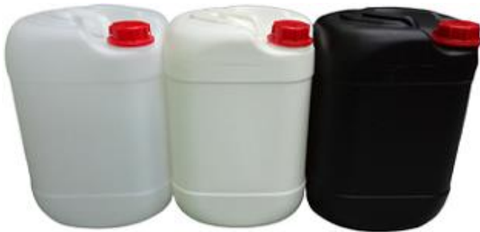
25L (CJ) UN 1.5 / 2.0 NATURAL WHITE / OPAQUE WHITE / BLACK