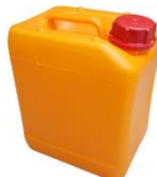
5L (S) YELLOW