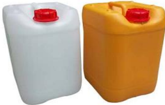
15L (A) NATURAL WHITE / ORANGE