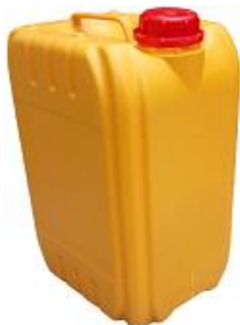
18L (G5) ORANGE