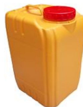
20L (G3 B) ORANGE