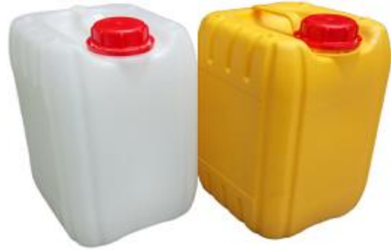
10L (G5) NATURAL WHITE / YELLOW