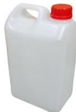
3L (A) NATURAL WHITE