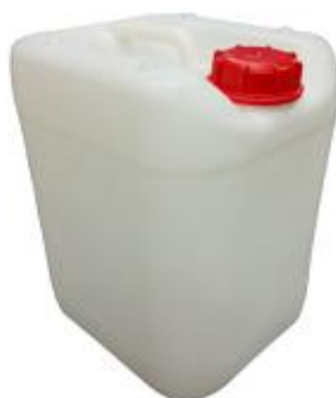
15L (A) NATURAL WHITE