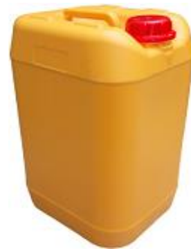
18L (C) YELLOW