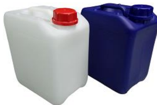
5L (S) NATURAL WHITE / BLUE