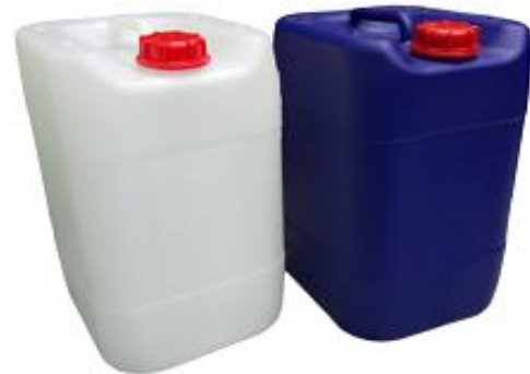
25L (AW) UN 1.2 NATURAL WHITE / BLUE