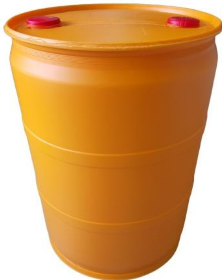
220L DOUBLE RING DRUM YELLOW

TIGHT HEAD DRUM - recommended for filling liquids products