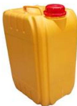
18L (G5 B) ORANGE