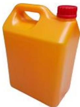
5L (A1) ORANGE