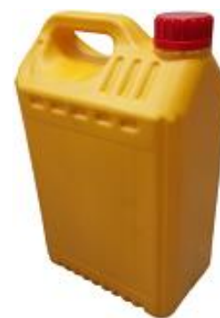
4L (AB) YELLOW