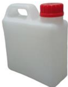
1L (A) (SQ) WITH HANDLE NATURAL WHITE