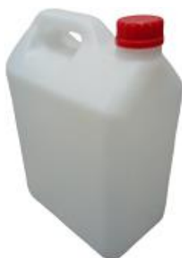
5L (A1) NATURAL WHITE