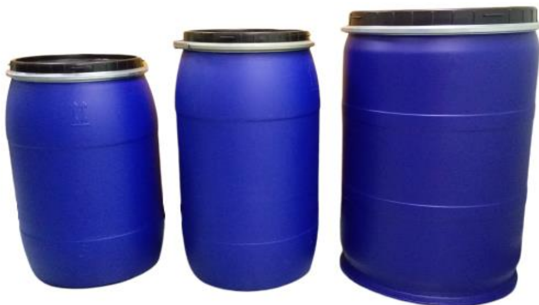
110L / 125L / 225L OPEN TOP DRUM