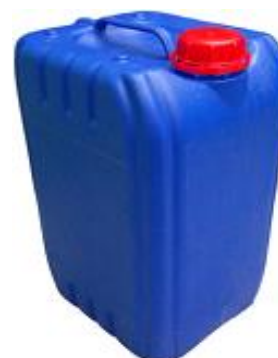
20L (G3) BLUE