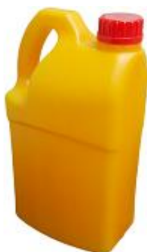
3L (C) ORANGE