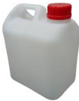
2L (A) WITH HANDLE NATURAL WHITE