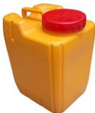
10L (G5 B) ORANGE