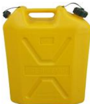
20L POL (2 MOUTH) YELLOW